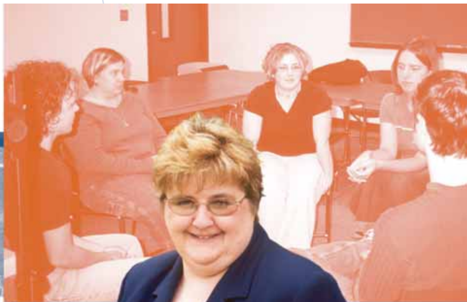
Social Work students during a class activity.

MVNU's growing Social Work program has an excellent reputation throughout Ohio. Organizations have often hired numerous graduates from Mount Vernon because of the quality and dedication found in them. Accreditation will only boost the program's recognition and commitment to excellence.